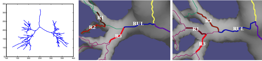
Fig. 1. Left: The method takes only the airway centerline tree as input. Middle-right: Airway trees are frequently topologically different, while geometric differences are small.

Several types of airway branch labeling algorithms have appeared previously. Van Ginneken et al. [11] and Lo et al. [5] use machine learning on branch features, with additional assumptions on airway tree topology. Among the features used are branch length, radius, orientation, cross-sectional shape and bifurcation angle. Branch length and radius are sensitive to the presence of structural noise or diseases like cystic fibrosis, tuberculosis or Chronic Obstructive Pulmonary Disease (COPD), and assumptions on tree topology make these methods vulnerable to topological differences. Tschirren et al. use association graphs [10] for pairs of airway trees, which incorporate information from both trees, such that maximal cliques in the association graph induce branch matchings between the original graphs. This is a combinatorial construction, although it can depend on the geometric properties of the initial trees. Such a separation of geometric and combinatorial properties can be problematic, as airway trees are often geometrically and visually similar despite being combinatorially different, as in Fig. 1. Feragen et al. [2] label airways based on geodesics (shortest paths) in a space of trees. Their tree-space is highly non-linear and has no known efficient algorithm for geodesic computation, making labeling of a complete airway tree infeasible.